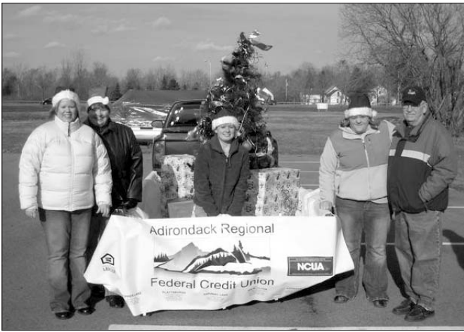
Clockwise from above, Potsdam employees spread holiday cheer at the Santa Parade. Santa listens to a young member's Christmas list. Rudolph waits for the coloring contest winner to claim him. Tupper Lake employees stand with donated toys for the Kiwanis gift drive.